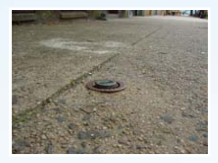
Hardware Trip Hazard